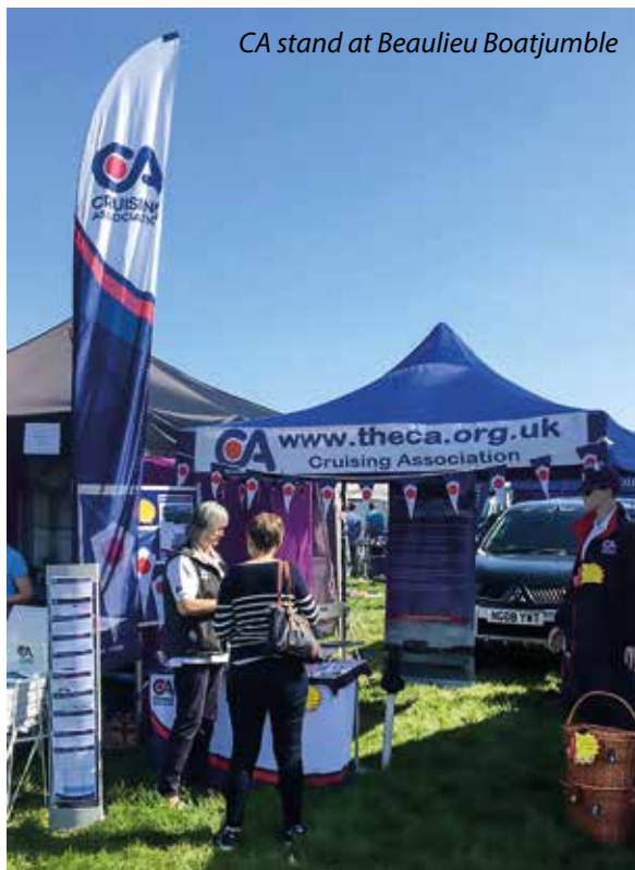
CA stand at Beaulieu Boatjumble