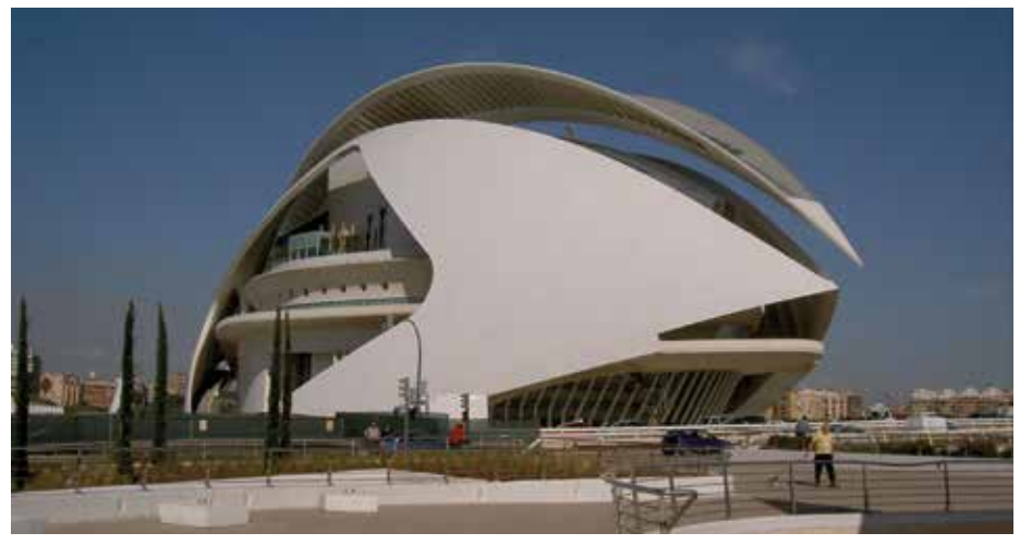
Above left, small bay next to Cabo de St Antonio, Costa Blanca; a typical cala, sheltered only from the north and west. Above, The opera house at Valencia City of the Arts and Sciences, Below, lounge of the parador in Oropesa

once you have got used to the system, securing is straightforward.