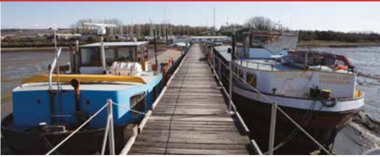
Left, barges on the old pontoon and below, client boats new and old