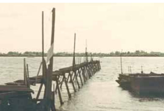
Above, WicorMarine's original jetty. Below, the old tractor and adapted trailer in use

There were 19 original moorings with big steel Admiralty buoys, which the