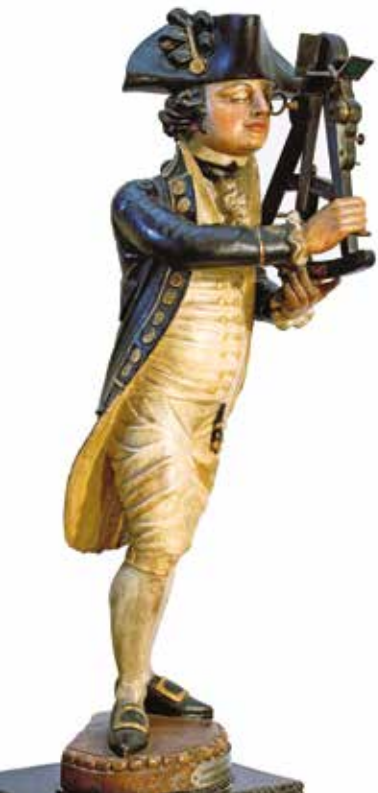
The "Little Wooden Midshipman", who once stood outside Norie & Wilson's shop in Leadenhall Street, is now in the Charles Dickens Museum – he featured in Dombey & Son . He is still visible on every Imray publication